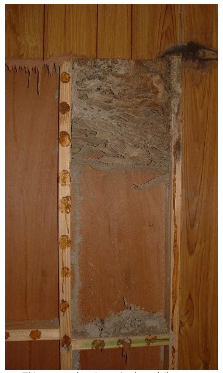
This nest was inactive at the time of discovery.

It was one of two sub-nests in this particular house. The other sub-nest had been treated several months earlier and it is considered that the treatment at the time also carried across to this as yet undetected termite nest.