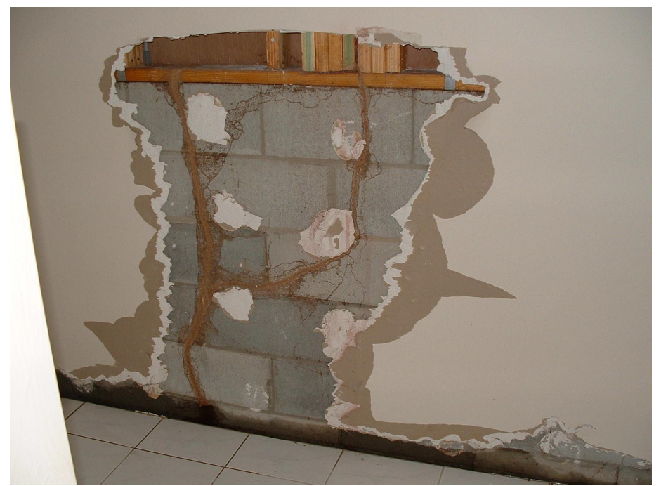
The owner of this home ripped open this wall (wrong thing to do!) after finding termites in the skirting board. The plaster covering the termite leads had been soft to the touch.

Another thing you are listening for when you are tapping is the sound of termites chattering back to you. Not all termite species chatter when they are disturbed but some do. If you tap on an area of termite activity and the termites are disturbed, they might warn each other by vibrating their bodies against the timber. The sound is faintly audible if you listen carefully and the room is quiet. It's about the same audio level as that of a bowl of rice bubbles popping after the milk's been added. Describing the sound is difficult, however if you can imagine that it sounds like the faint crinkling of cellophane, you're close.