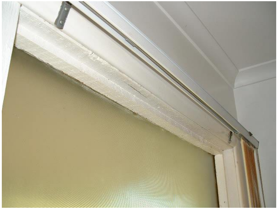
You can see the slit that was made in this hollow section of window frame. Active termites were noted inside the timber.

Another check you can do is to sight along your walls and look for any unusual bulges in the plaster. A bulge may indicate a termite nest.