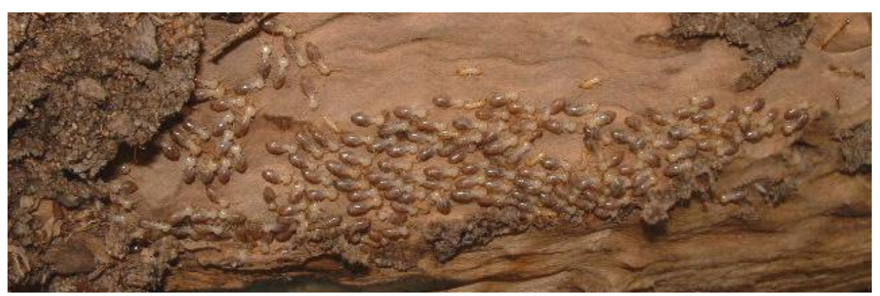
Small Schedorhinotermes soldiers with hundreds of fat juicy workers. Notice their dark guts.

Termites and black ants together. You will see that termites have a head and a body, two segments; whilst ants have three segments including the thorax that links their head to their body. Termite workers are creamy colour or white (hence the Australian colloquialism 'white ants'), but termites are not ants. Termite soldiers tend to be darker than workers, even deep brown with some species. Workers have see-through bodies and may be darker if they are eating a dark coloured timber... you can actually see inside their gut.