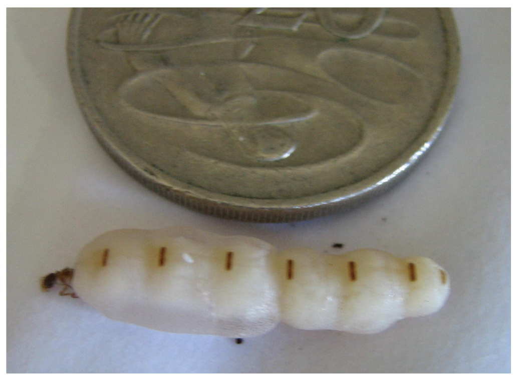
You won't find or see this girl too often – she's the Queen.