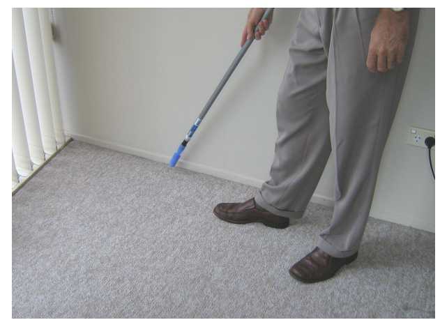
You only need to tap lightly. You should try to make each tap about 50mm apart. It takes a little practice and you will soon get into a rhythm. Try to balance the donger so that the swing becomes rhythmic.