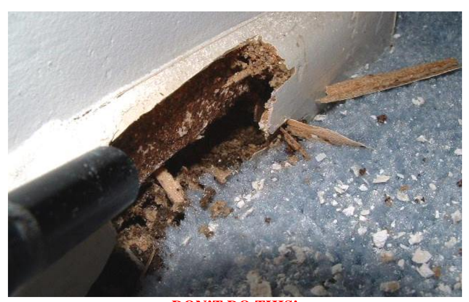
DON'T DO THIS!

If you do find a hollowed out piece of timber, do not break it open to take a look!