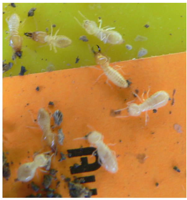
Workers and soldiers – Coptotermes.