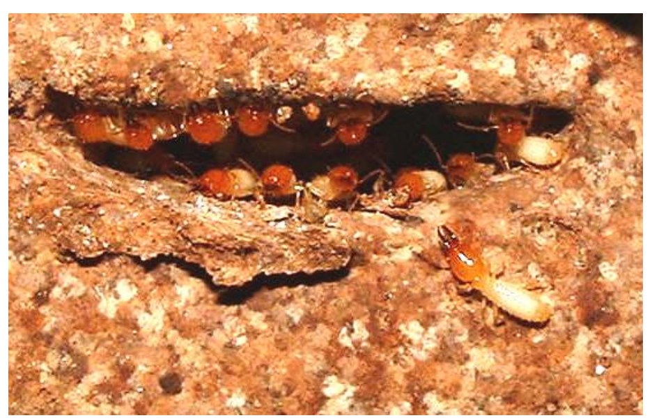
A group of Coptotermes soldiers vigilantly defending their entry point in a besser block wall after the plaster was removed to expose them.