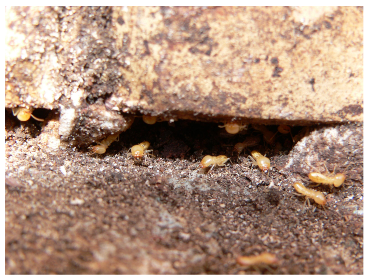
Schedorhinotermes soldiers in a gap between two bricks on the outside wall of a brick clad timber frame home. This entry point was located 30cm below ground level.

Quick tip: If you find termites and want to have them identified, collect a few soldiers and send them to Green Termite Bait Systems. Just catch them with a bit of sticky tape then stick them to a piece of paper with your name address and phone number.