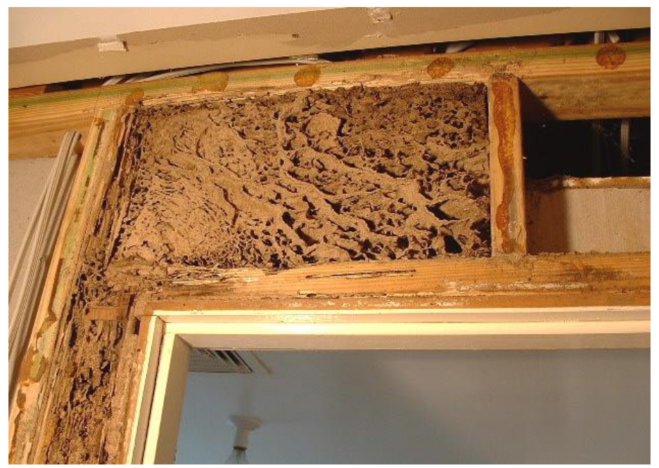
This picture shows the original nest that was treated in an adjacent bathroom.