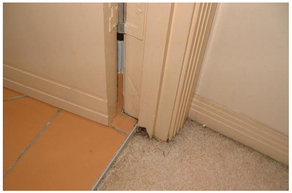
Can you see the ripples in the paint in this door frame?

Please remember that termites are very shy and if you disturb them, they may abandon their workings. Consequently you could lose an excellent opportunity to effectively treat them. It's harder and more expensive to treat termites if they have left the scene of their crime. Once again for emphasis, if you find termites, please do not disturb them .